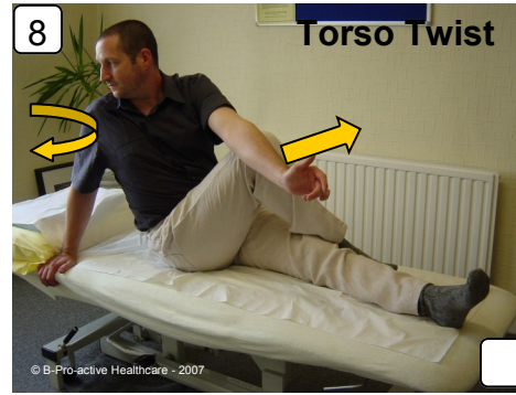
Place both hands behind in sitting position. Bend leg up and cross ankle over the opposite knee as shown. Place opposite arm on the bent knee and rotate and push with the elbow at the same time