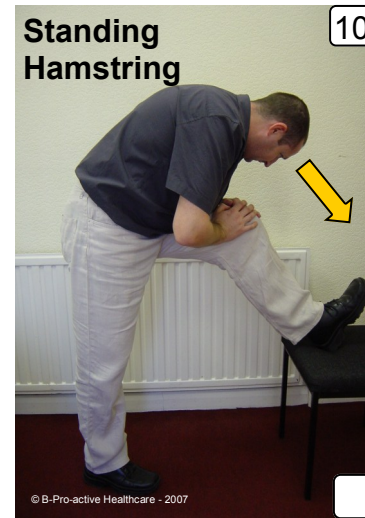
From the lunge position, lean back, rest your heel on the seat pan. Go into the reversed lunge by keeping the knee bent and bending forward. Feel a gentle stretch and hold for the allotted time. Change to the opposite leg and repeat for the other side.

Remember, No Pain and No Bouncing as you stretch!!!!