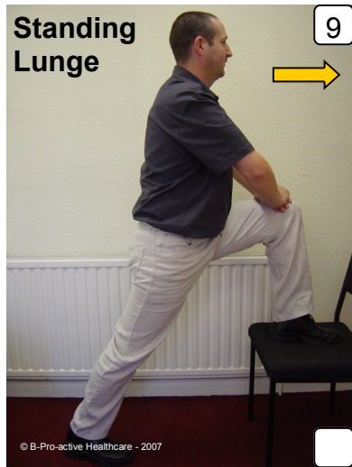
Standing half a meter from the chair, place foot in the middle of the seat pan. Place hands on the knee for support. Gently lean forward. Keep your body upright, looking straight ahead and hold for the allotted time. Feel a gentle stretch with no pain.